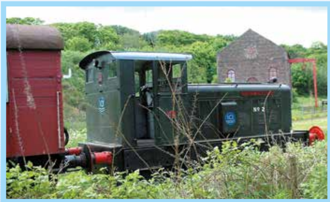
PRESTONGRANGE MINING MUSEUM

Discover East Lothian's colourful history along the John Muir Way, from Musselburgh's Roman Bridge to the ruined Dunbar castle, once a refuge for Mary Queen of Scots. Explore the industrial heritage of the Prestonpans area, famous for its salt pans, and the many harbours along the Way, once thriving fishing ports.