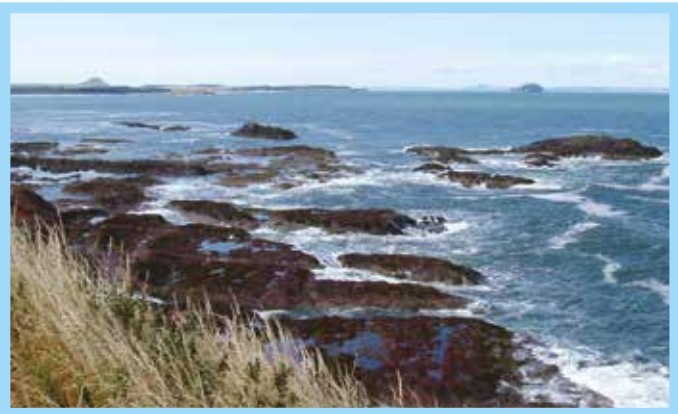
VIEW FROM CLIFF TOP TRAIL, DUNBAR

East Lothian has a richly varied landscape, from the coastline featuring sandy beaches, cliffs and dunes, through rolling lowland shaped by agriculture to the backdrop of the Lammermuir Hills. These paths also pass by rivers, woodland and waterfalls.