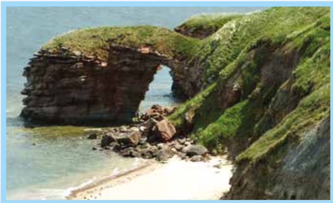
SANDSTONE ARCHES NEAR BILSDEAN

Many fascinating geological features can be seen along these East Lothian coastal paths. These range from the volcanic remains of the Bass Rock and North Berwick Law, to the cliffs at Dunbar and the sandstone arches at Bilsdean. Take time to explore the wealth of geology around Barns Ness.